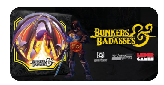
Bunkers & Badasses by Nerdvana, Gearbox and Leder Games: Characters, Weapons, and Environment (Concept & Illustrations).